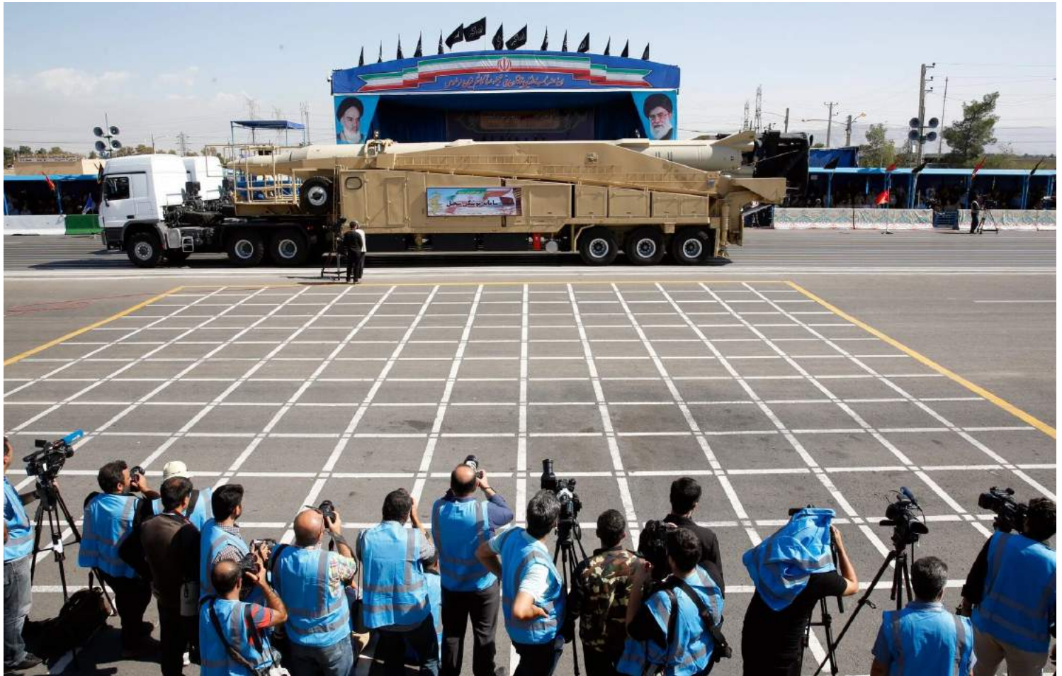
One of the most difficult challenges for Iran was to build a nuclear warhead small enough to fit atop a long-range missile like the one seen in a military parade in Tehran in 2018.

Israeli agents had also killed the Iranian general in charge of missile development and 16 members of his team.