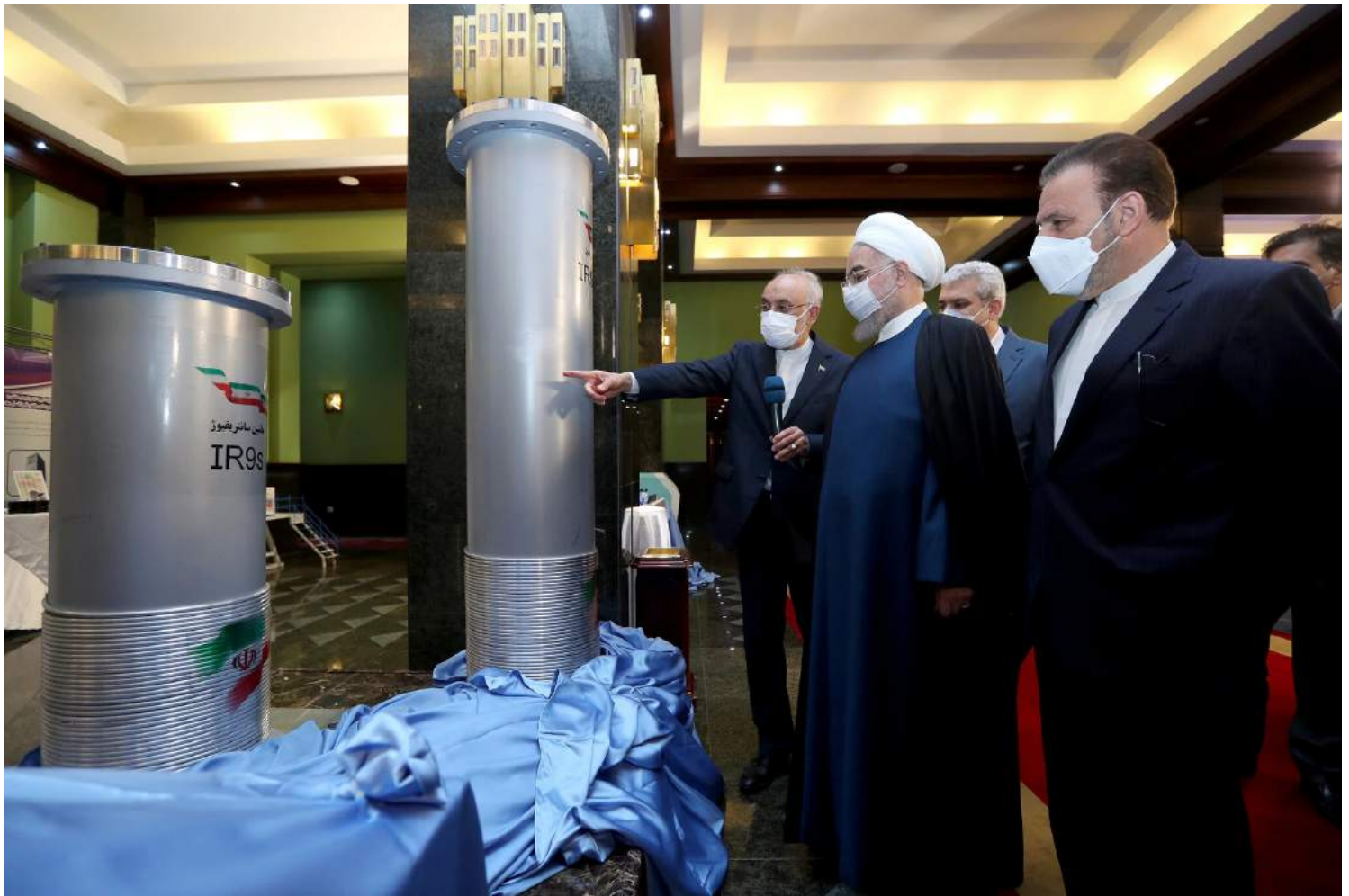
President Hassan Rouhani, second from left, visiting an exhibition in Tehran on Iran's nuclear program in April.