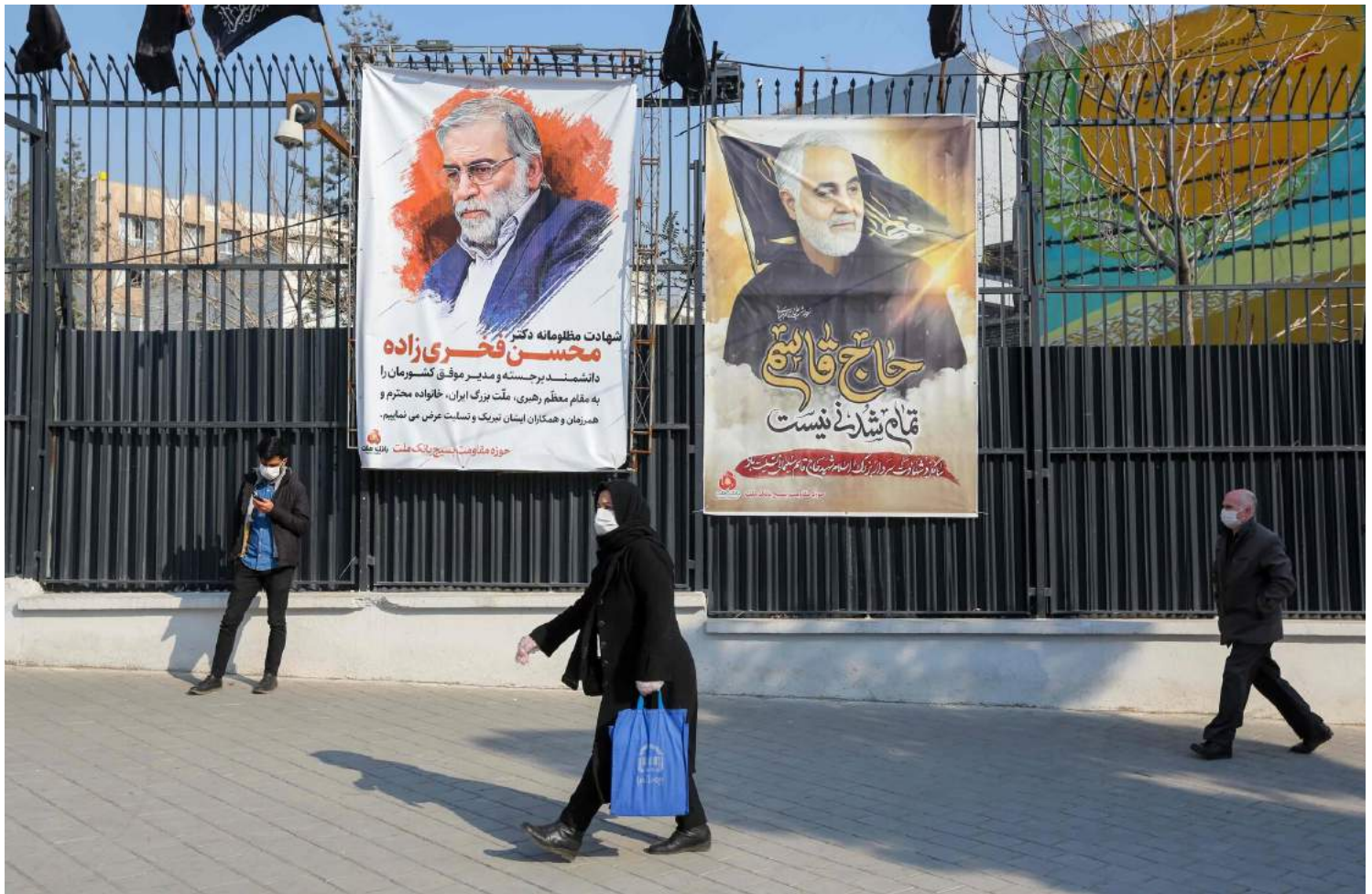
Posters in Tehran honoring national heroes and martyrs. Mr. Fakhrizadeh, left, was relatively unknown, while General Suleimani was famous.

According to the Mossad, the bomb-building program had simply been deconstructed and its component parts scattered among different programs and agencies, all under Mr. Fakhrizadeh's direction.