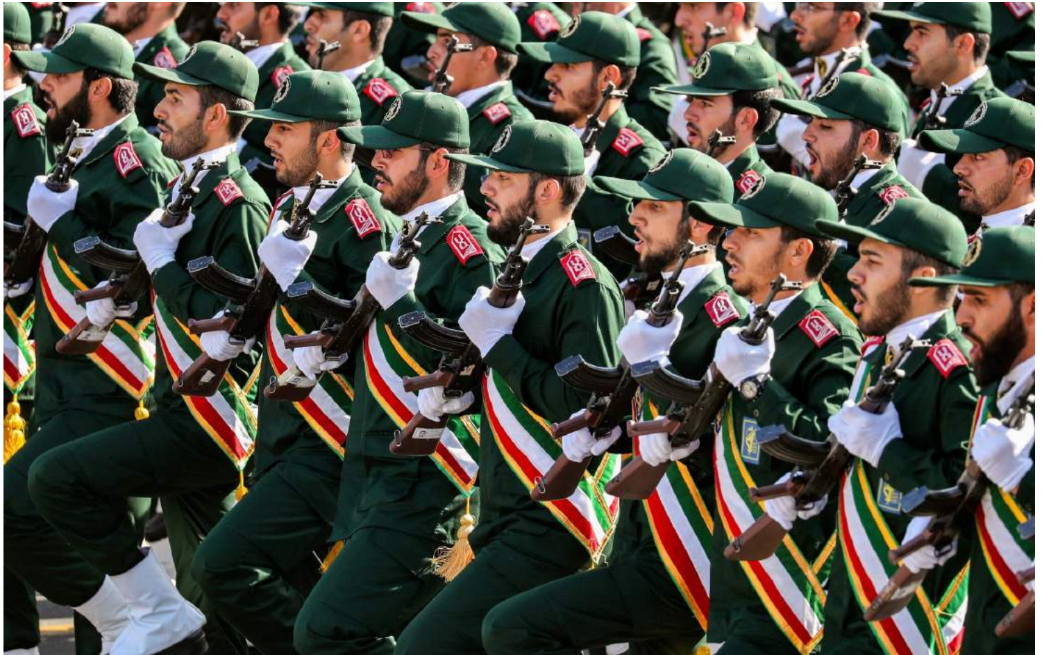
Members of the Revolutionary Guards in Tehran in 2018. A special unit of the Guards was in charge of Mr. Fakhrizadeh's security.

The recriminations and paranoia among politicians and intelligence officials only intensified after the assassination. Rival intelligence agencies — under the Ministry of Intelligence and the Revolutionary Guards — blamed each other.