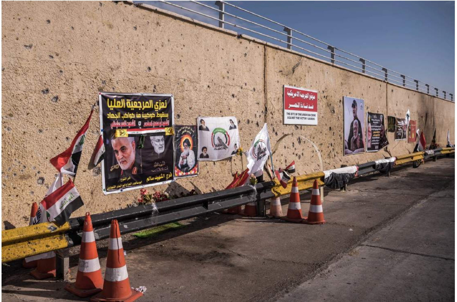
Memorials at the Baghdad airport, where Maj. Gen. Qassim Suleimani was killed. The Suleimani killing offered lessons for both Israel and Iran.

His security details belonged to the elite Ansar unit of the Revolutionary Guards, heavily armed and well trained, who communicated via encrypted channels. They accompanied Mr. Fakhrizadeh's movements in convoys of four to seven vehicles, changing the routes and timing to foil possible attacks. And the car he drove himself was rotated among four or five at his disposal.