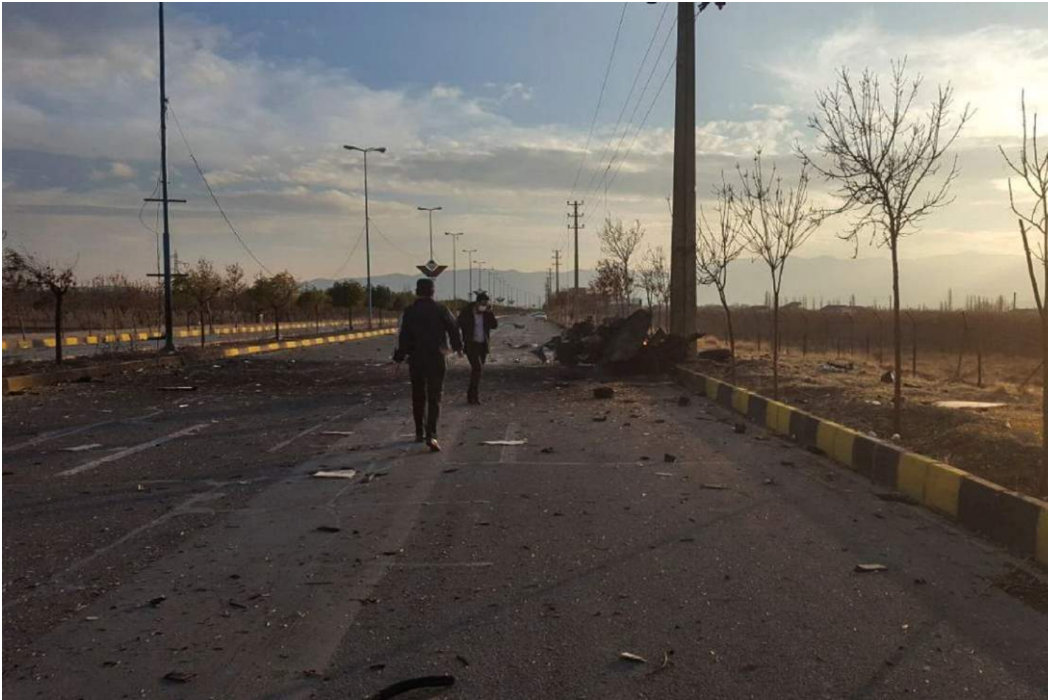
Imam Khomeini Boulevard in Absard after the assassination.

According to Iran's Fars News, three more bullets tore into his spine. He collapsed on the road.