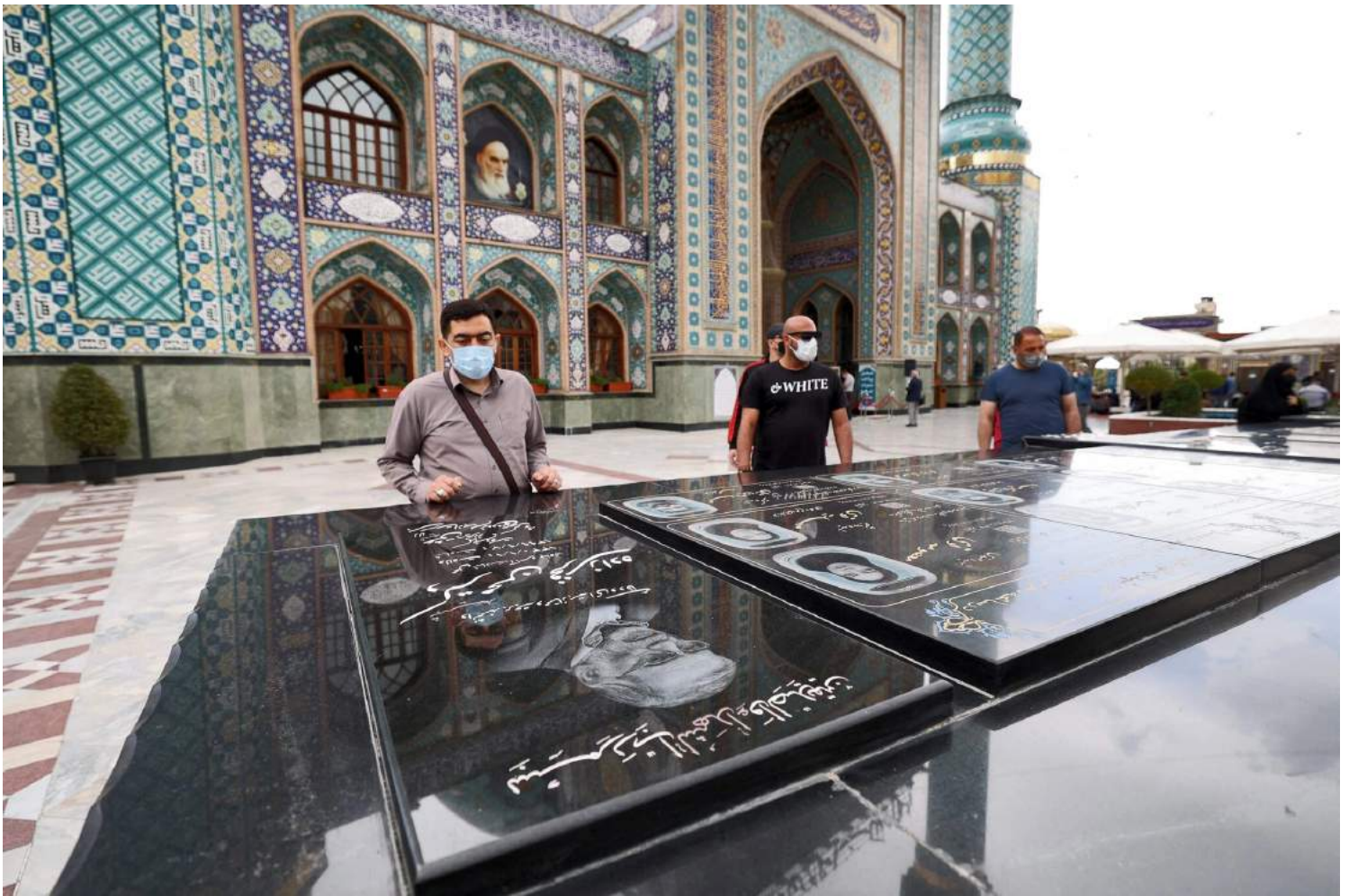
The grave of Mr. Fakhrizadeh at the Imamzadeh Saleh shrine in Tehran.