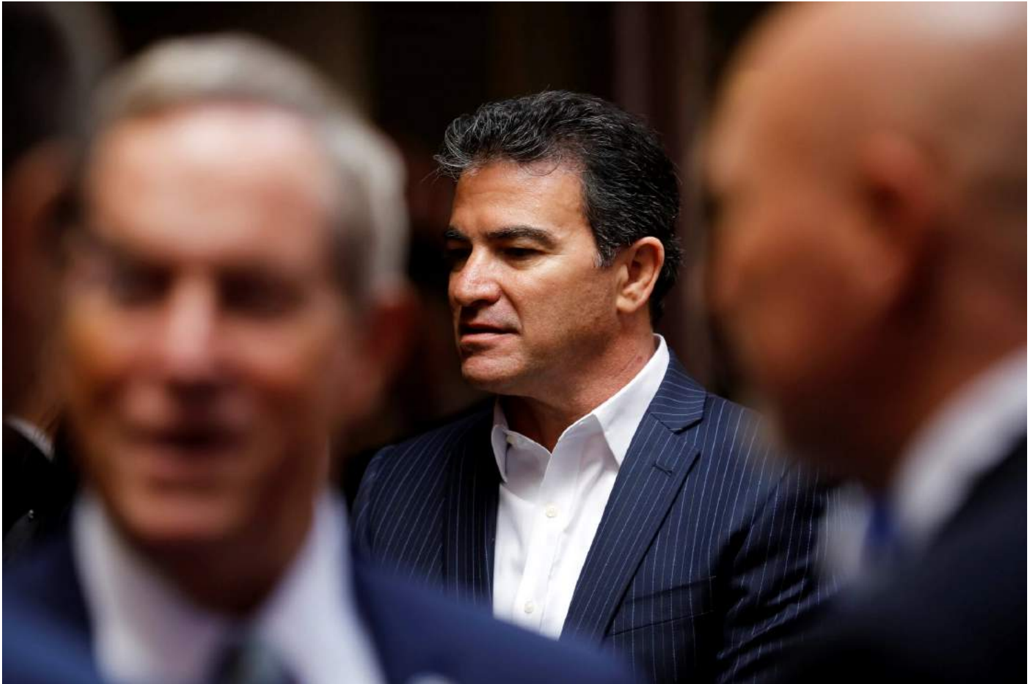
The Mossad director, Yossi Cohen, presented Israel's plans to President Donald J. Trump, Secretary of State Mike Pompeo and the C.I.A. director, Gina Haspel.

Preparations for the assassination began after a series of meetings toward the end of 2019 and in early 2020 between Israeli officials, led by the Mossad director, Yossi Cohen, and high-ranking American officials, including President Donald J. Trump, Secretary of State Mike Pompeo and the C.I.A. director, Gina Haspel.