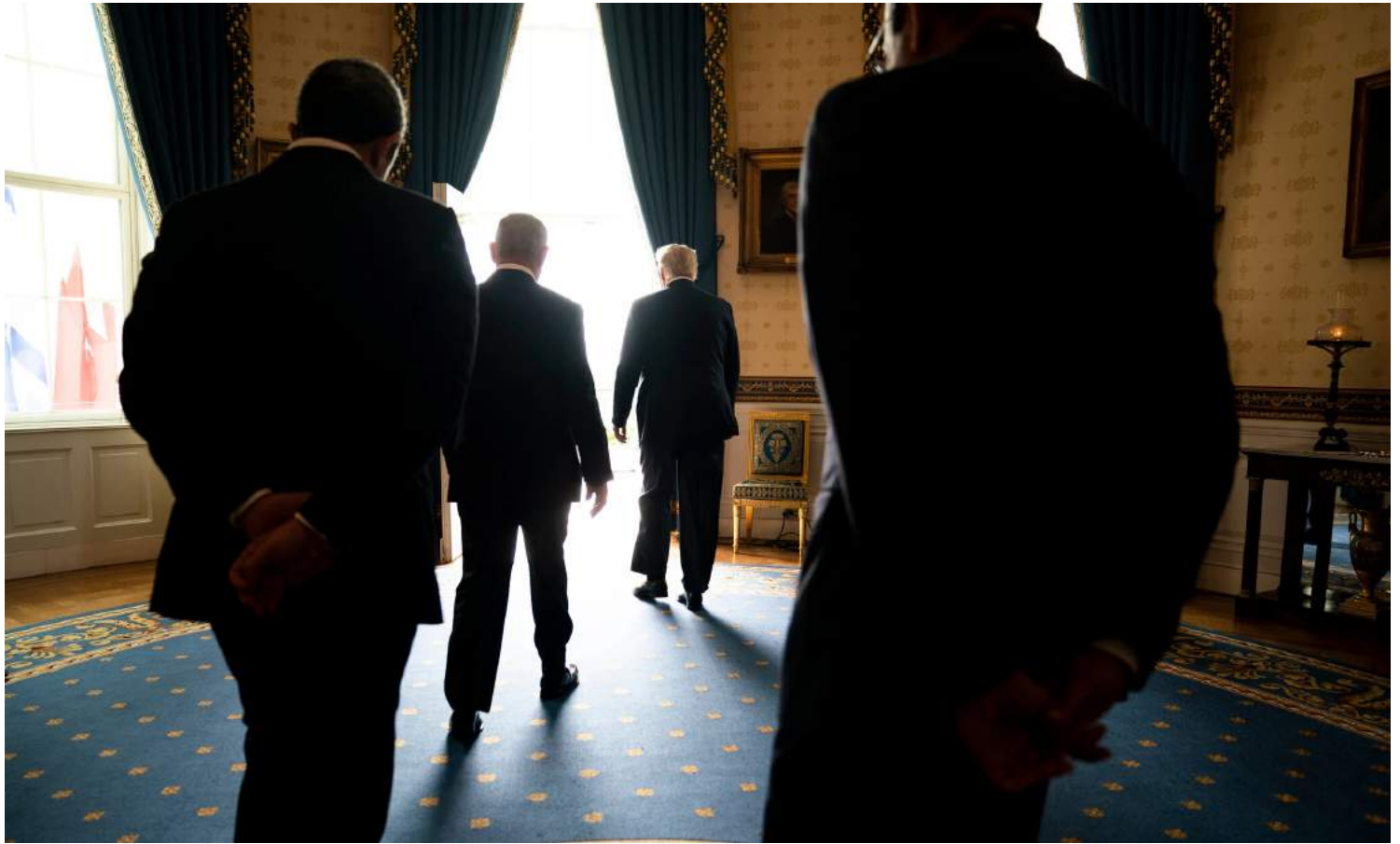
President Donald J. Trump and Prime Minister Benjamin Netanyahu at the White House in September 2020. Israel wanted to act while Mr. Trump was still in office.

By the summer, it looked as if Mr. Trump, who saw eye to eye on Iran with Mr. Netanyahu, could lose the American election. His likely successor, Joseph R. Biden Jr., had promised to reverse Mr. Trump's policies and return to the 2015 nuclear agreement that Israel had vigorously opposed.