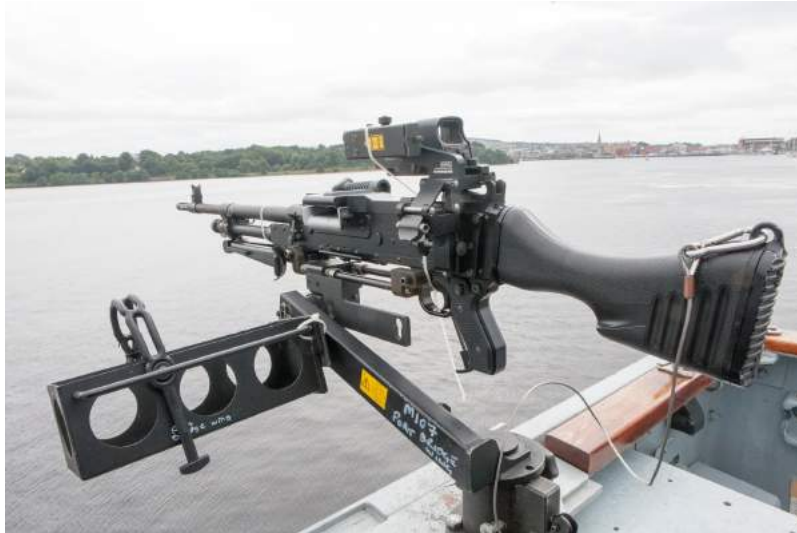
Israel used a special model of a Belgian-made FN MAG machine gun, similar to this one, attached to a robotic apparatus.

There were further complications in firing the weapon. A machine gun mounted on a truck, even a parked one, will shake after each shot's recoil, changing the trajectory of subsequent bullets.