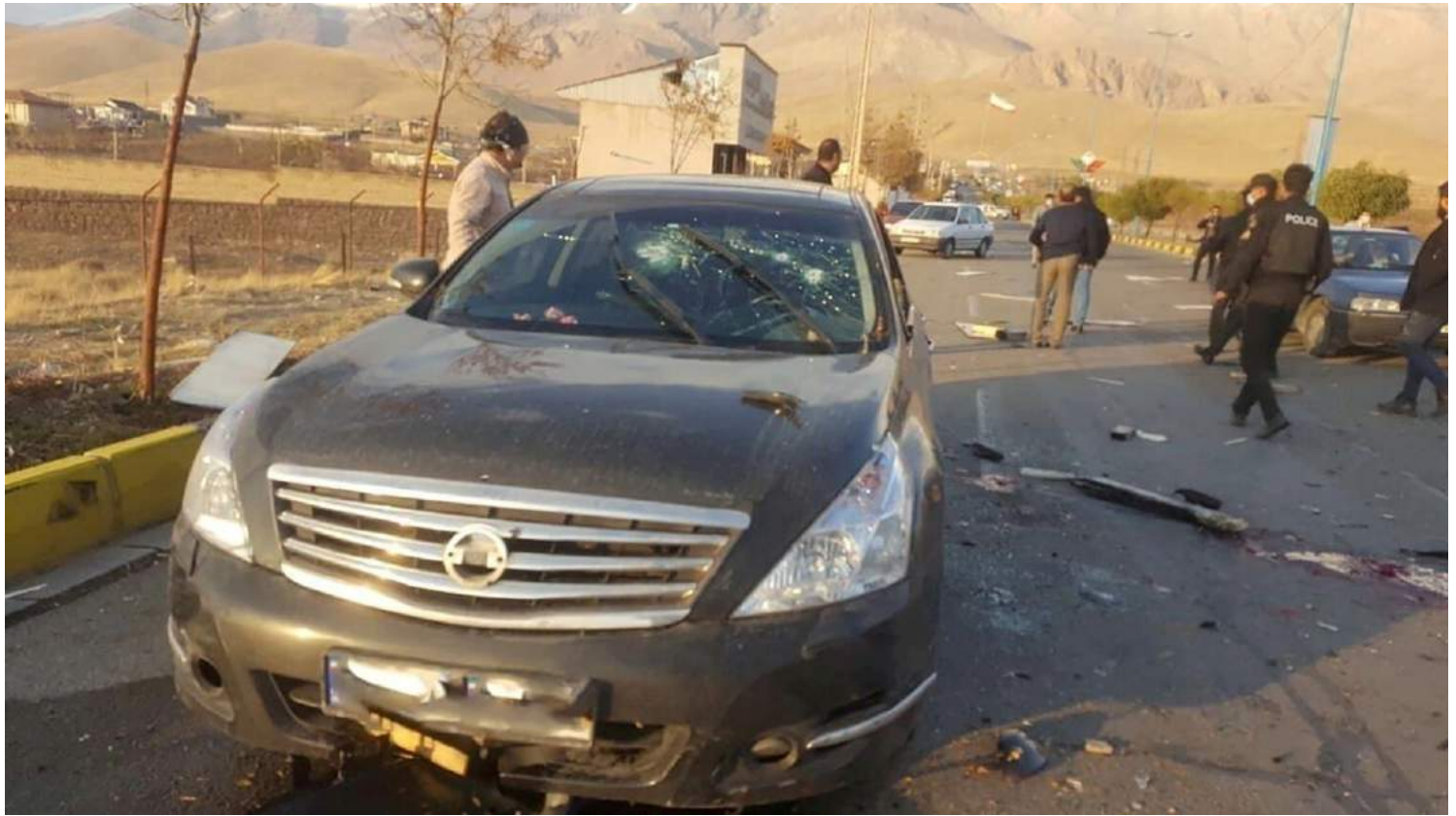
Mr. Fakhrizadeh's Nissan Teana and blood on the road after the attack on Nov. 27, 2020.

One of the most far-fetched accounts emerged a few days later.